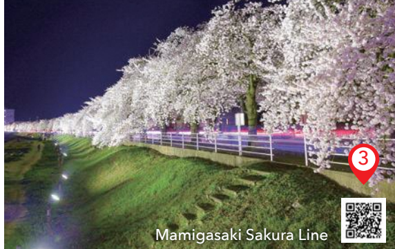
3 Mamigasaki Sakura Line