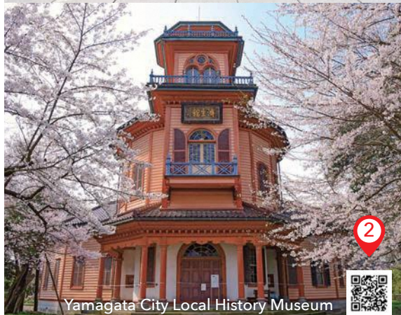
2 Yamagata City Local History Museum