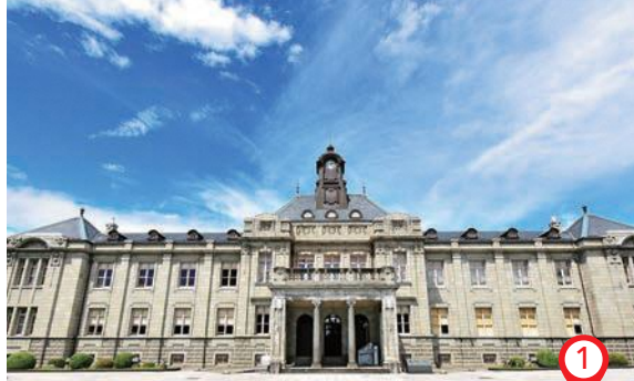
1 Bunshokan (Former Prefectural Office and Assembly Building)