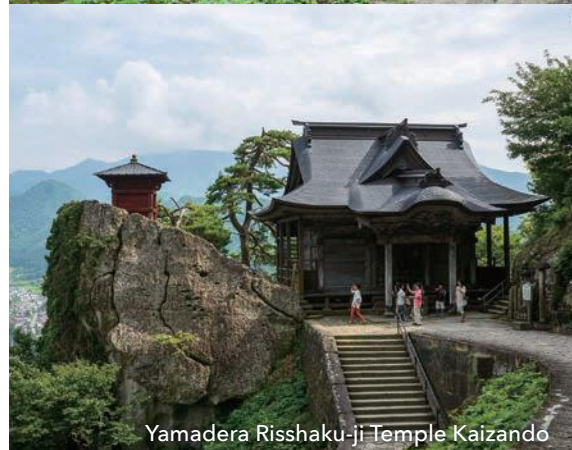
4 Tarumizu Ruins Yamadera Risshaku-ji Temple Kaizendo Where Matsuo Basho composed his famous haiku poem: Such stillness / The cicadas cries / Sink into the rocks.