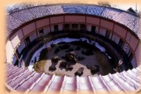
View from second floor auditorium